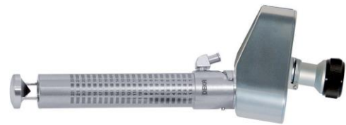
Laser Vaginal Probe

In cases of vaginal atrophy, water is less present in the dry surface epithelium of the vaginal wall and is more present in the underlying connective tissue. Therefore, minimal damage occurs to the actual vaginal epithelium while more thermal energy is absorbed by the sub-epithelial layer.